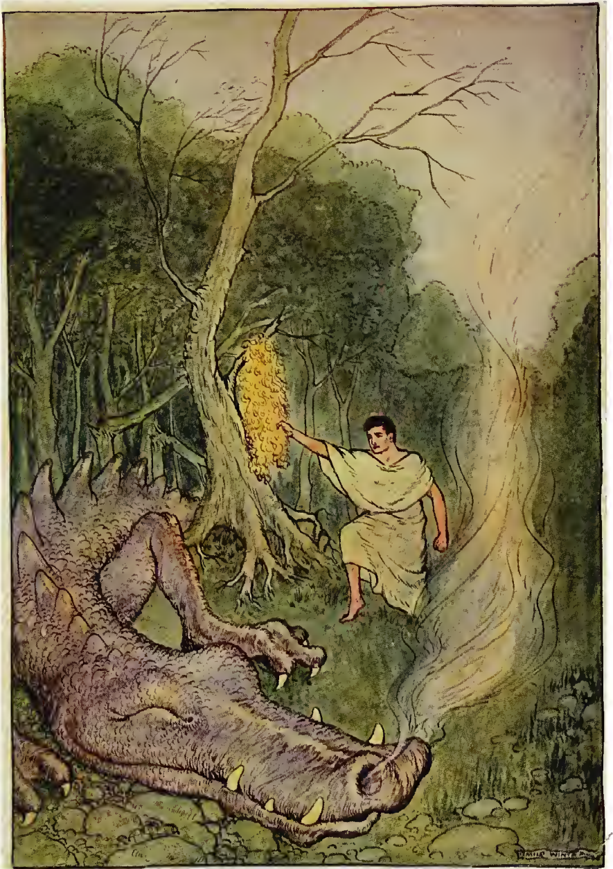
Jason caught the fleece from the tree